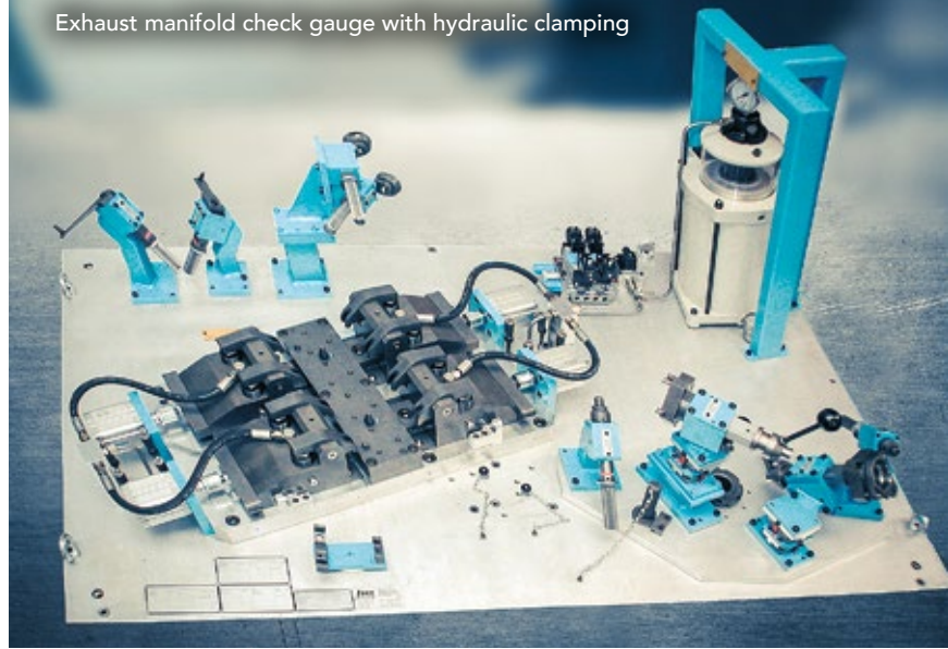
Exhaust manifold check gauge with hydraulic clamping

"True-to-size products thanks to precision gauging"