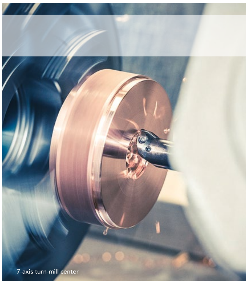
7-axis turn-mill center