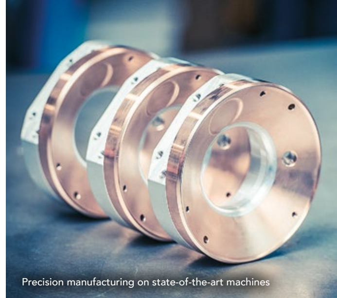
Precision manufacturing on state-of-the-art machines

To always keep ourselves up-to-date with the latest technology, we regularly replace our manufacturing machinery. You can see the current equipment at DKT on our website: www.brd-dkt.de (under "Machines")