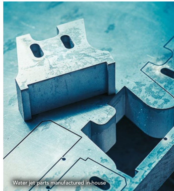
Water jet parts manufactured in-house

"Top quality – to your exact specifications"