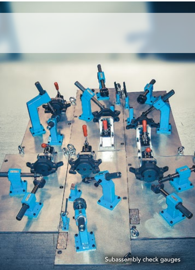
Subassembly check gauges

We can measure gauges up to four meters in length, making our machines the best-equipped for all conventional sizes.